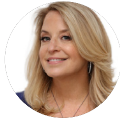
Dr. Laura Berman Therapist & Grieving Mother

The Healers and Teachers chosen for your retreat create a nourishing support for your experience. Past teachers who have donated their time include the below, and the full list will be confirmed in early 2025.